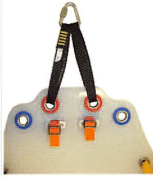
Sewn Slings and karabiners OR Delta Mallion Rapide