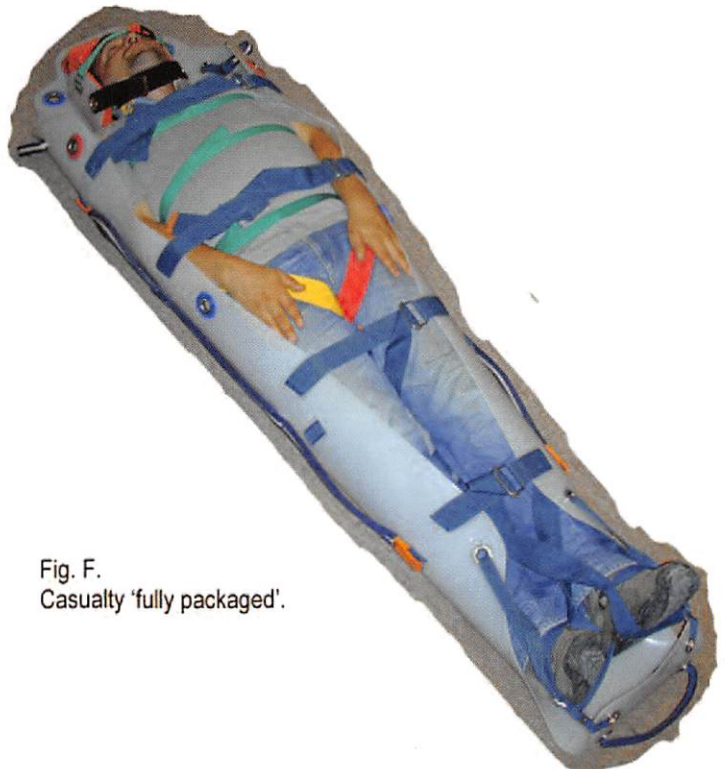
Fig. F. Casualty 'fully packaged'.